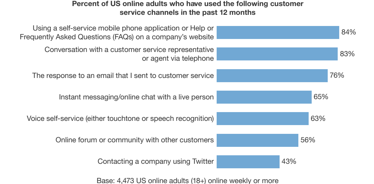
FIGURE 3 Consumers Increasingly Use Self-Service Channels For Customer Service